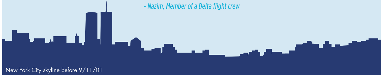
New York City skyline before 9/11/01