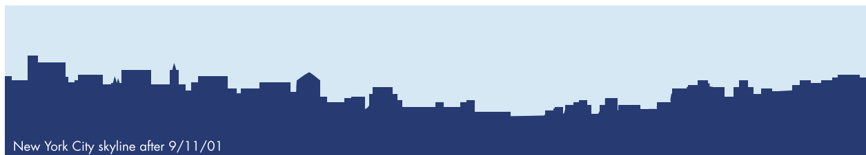
New York City skyline after 9/11/01

President Bush declares that America, along with its friends and allies would “stand together.” to win the war against terrorism.